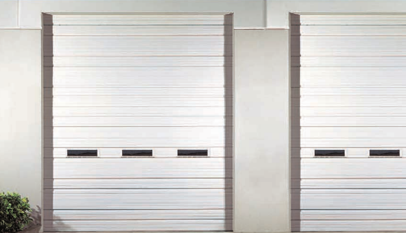
Model 524 with 24" x 6" Lites