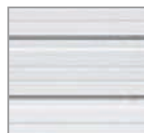
Ribbed Panel Design